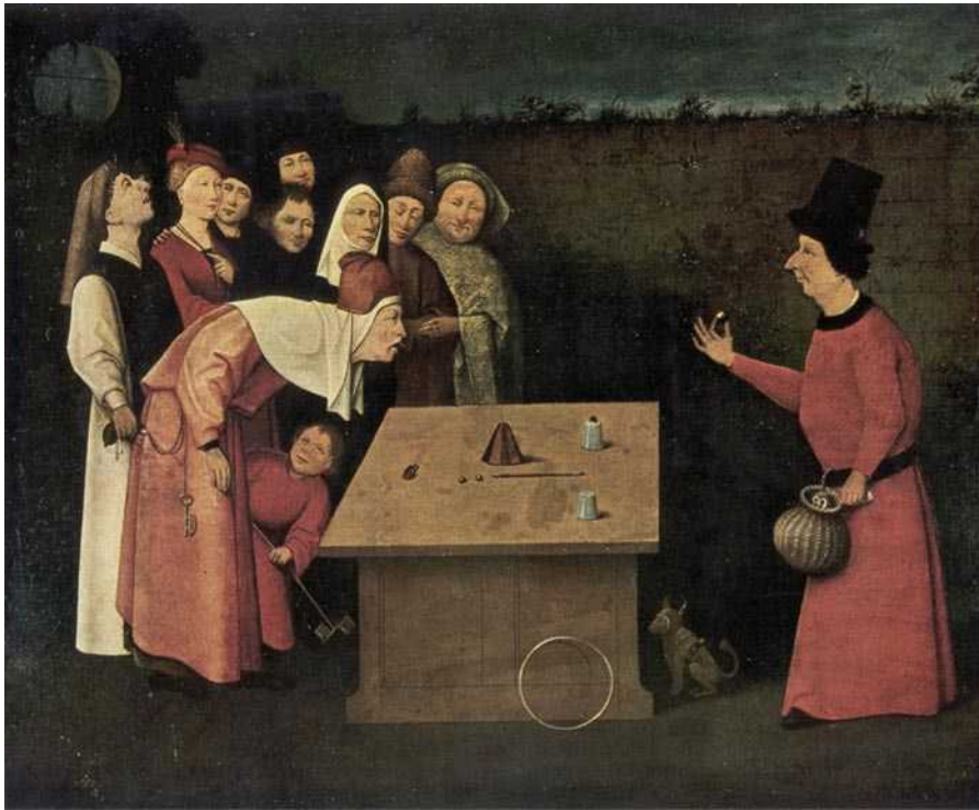
Figure 1 | The Conjurer, by Hieronymus Bosch. A magician performs for the crowd in medieval Europe, while pickpockets steal the spectators' belongings. The painting is in the Musée Municipal in St.-Germain-en-Laye, France.

(or Rubber Tree) illusion 8 , in which an oscillating bar (or rubber tree) seems to bend when it is bounced rapidly. The neural basis of this illusion lies in the fact that end-stopped neurons (that is, neurons that respond both to motion and to the terminations of a stimulus' edges, such as corners or the ends of lines) in the primary visual cortex (area V1) and the middle temporal visual area (area MT, also known as area V5) respond differently from non-end-stopped neurons to oscillating stimuli 8-11 . This differential response results in an apparent spatial mislocalization between the ends of a stimulus and its centre, making a solid object look like it flexes in the middle.