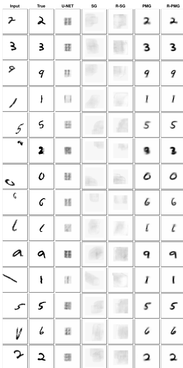
Figure 2. Additional MNIST spatial transformation results.